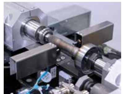
Fast and highly flexible acquisition of shaft geometry