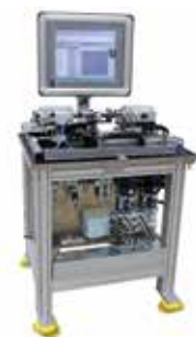
Stand-alone measuring system for gear shafts