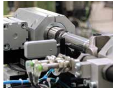
Highly accurate measurements guaranteed by the use of high-quality individual sensors