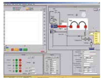
Electronic control unit